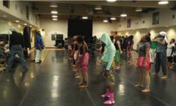
AACC in rehearsal at the Brooklyn Academy of Music.