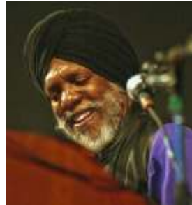
Dr. Lonnie Smith